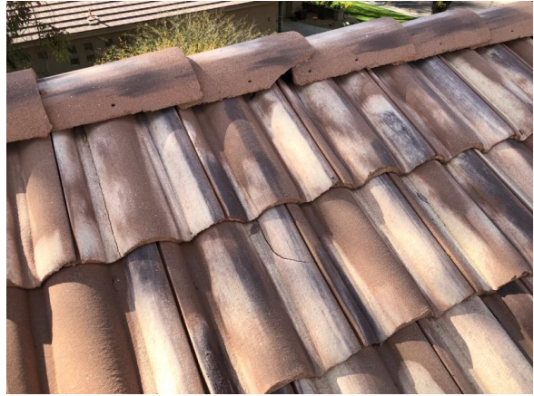
Broken ridge and field tile