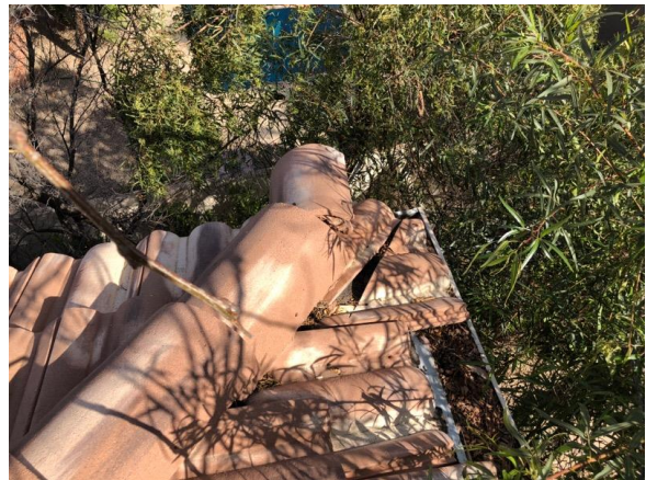
Slipped ridge tile and missing field tile