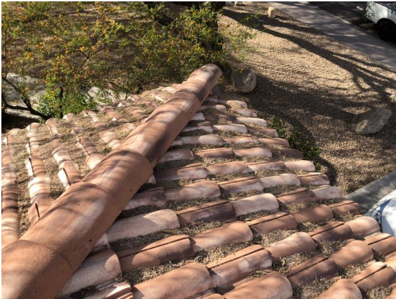
Debris on roof