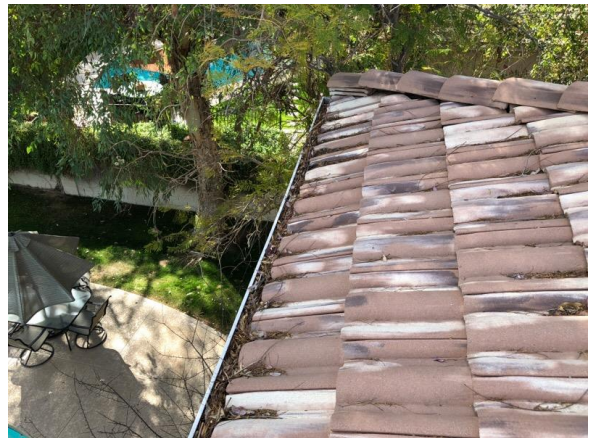
Debris on roof and in gutters