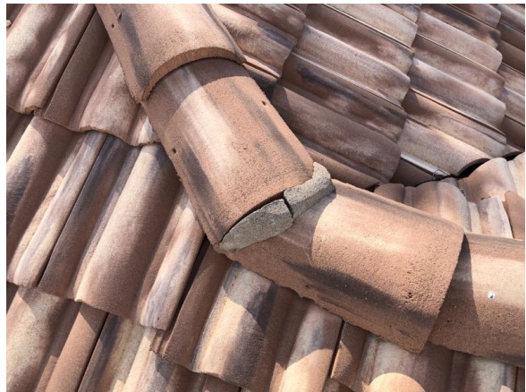
Broken mortar pack