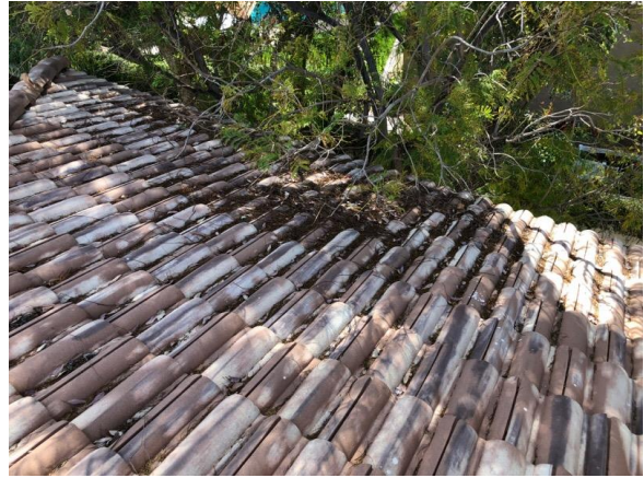
Debris on roof, landscaping needs to be trimmed back at least three feet