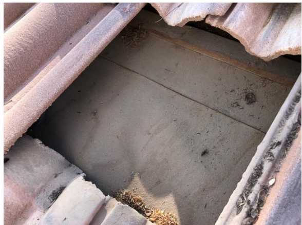
Underlayment is old for regional standards