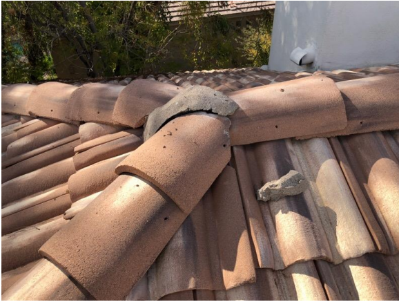
Broken mortar pack