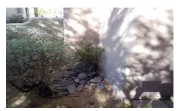
PA- plant abutting structure