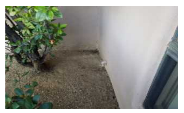
FG water drains and or stands against the structure