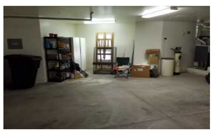
OB--personal items stored in garage