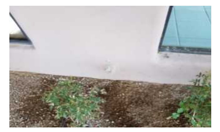
WD water damage to the stucco or sprinkler heads hit it