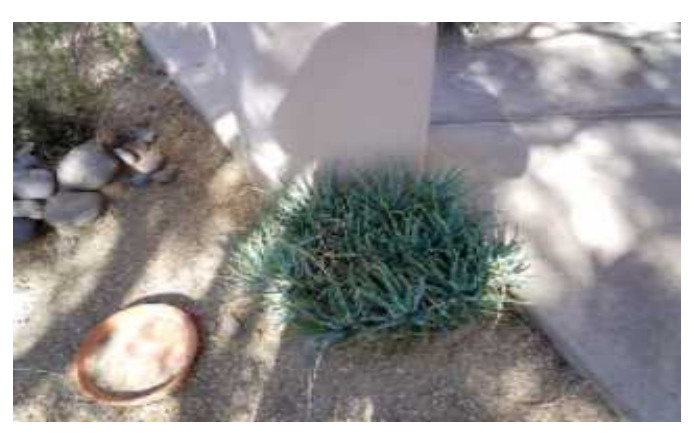
PA- plant abutting structure