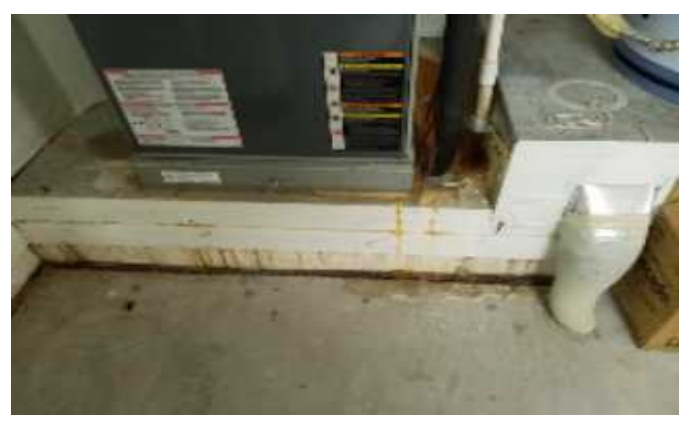
Ws water stains on the air handler and hot water tank pedestals